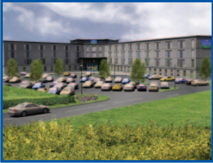
Image of new Express by Holiday Inn hotel at Stansted Airport being developed by Kew Green VCT (Stansted).