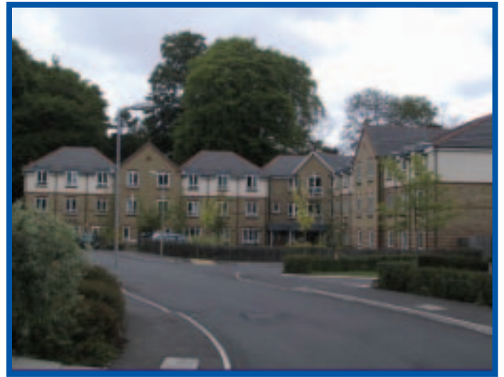
Applecroft Care Home in Dover.