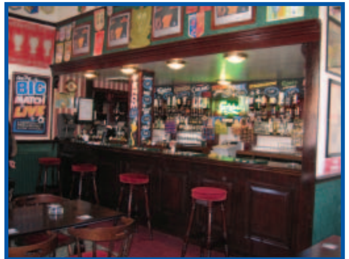
Newly refurbished interior of The Holt Pub in Liverpool owned by The Bold Pub Company.