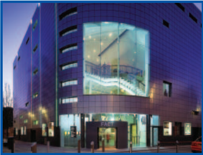
FACT centre containing the Picturehouse cinema in Liverpool.