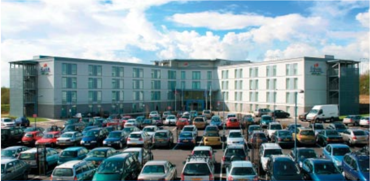
The new Express by Holiday Inn at Stansted Airport developed by Kew Green VCT (Stansted) Limited