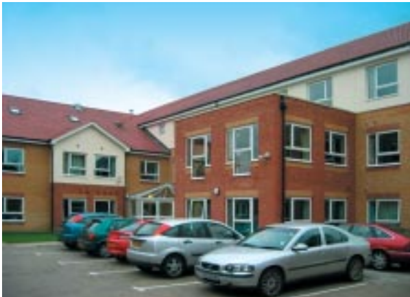
Barleycroft Care Home in Romford