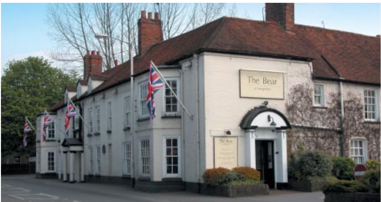
The Bear Hotel in Hungerford recently acquired by The Bear Hungerford Limited