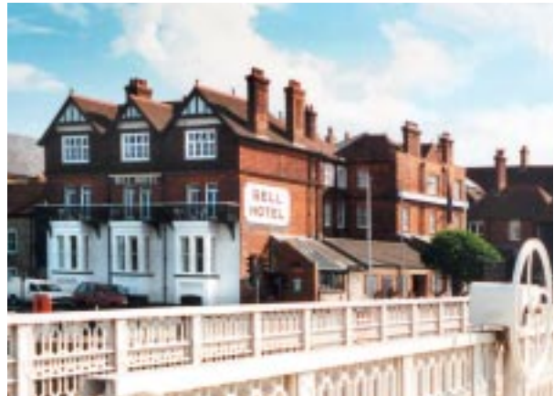
The Bell Hotel in Sandwich recently acquired by The Place Sandwich VCT Limited